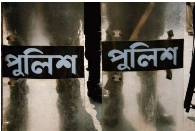
Police No English

These are men at the Islamist rally, whose photographs open Naeem Mohaiemen's vivid, colorful, smart show. Mohaiemen's pictures are from one day, which opens with an Islamist rally that spills out of the mosques and onto the streets. They have their own demands, equal parts anti-imperialist and pro- Quranic . As the afternoon moves in, and the sun provides the kind of languid afternoon well known in both West Bengal and Bangladesh, the leftists move to the streets, unfurling the