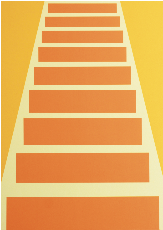
Masaharu Sato, Stairs , 2018 , acrylic on board, 35 7/8 × 25 5/8". © Estate of Masaharu Sato.

This theme of alertness is manifest throughout the Triennale, not always to benign effect. In Taus Makhacheva's Quantitative Infinity of the Objective , 2019, it emerges in the harshly critical exhortations ("Why can't you be like everybody else?") we hear as we contemplate a chamber full of gymnastics equipment. The amplified demands of invisible coaches elevate the sense of blame into a monumental presence that cannot be ignored. In Lebohang Kganye's dark, narrow room packed with shadowy figures ( Mohlokomedi wa Tora [Lighthouse Keeper], 2017), it is in the light that keeps illuminating alternate corners of the space. In Rayyane Tabet's rubbings of ancient carved artifacts excavated in Syria, as in Takashi Arai's daguerreotypes of intricately knotted sashes made by Japanese women for soldiers during World War II, we're reminded of the vigilance required to carry out acts of documentation or care that seem almost obsessive-compulsive. One cannot dismiss any detail, because it might prove to be the key to our grasp of a spectral whole, a world that does not fully exist yet refuses to entirely disappear. This is what Masaharu Sato's